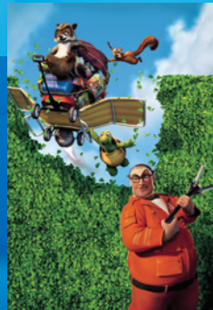
Over The Hedge