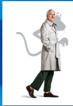
The Pink Panther