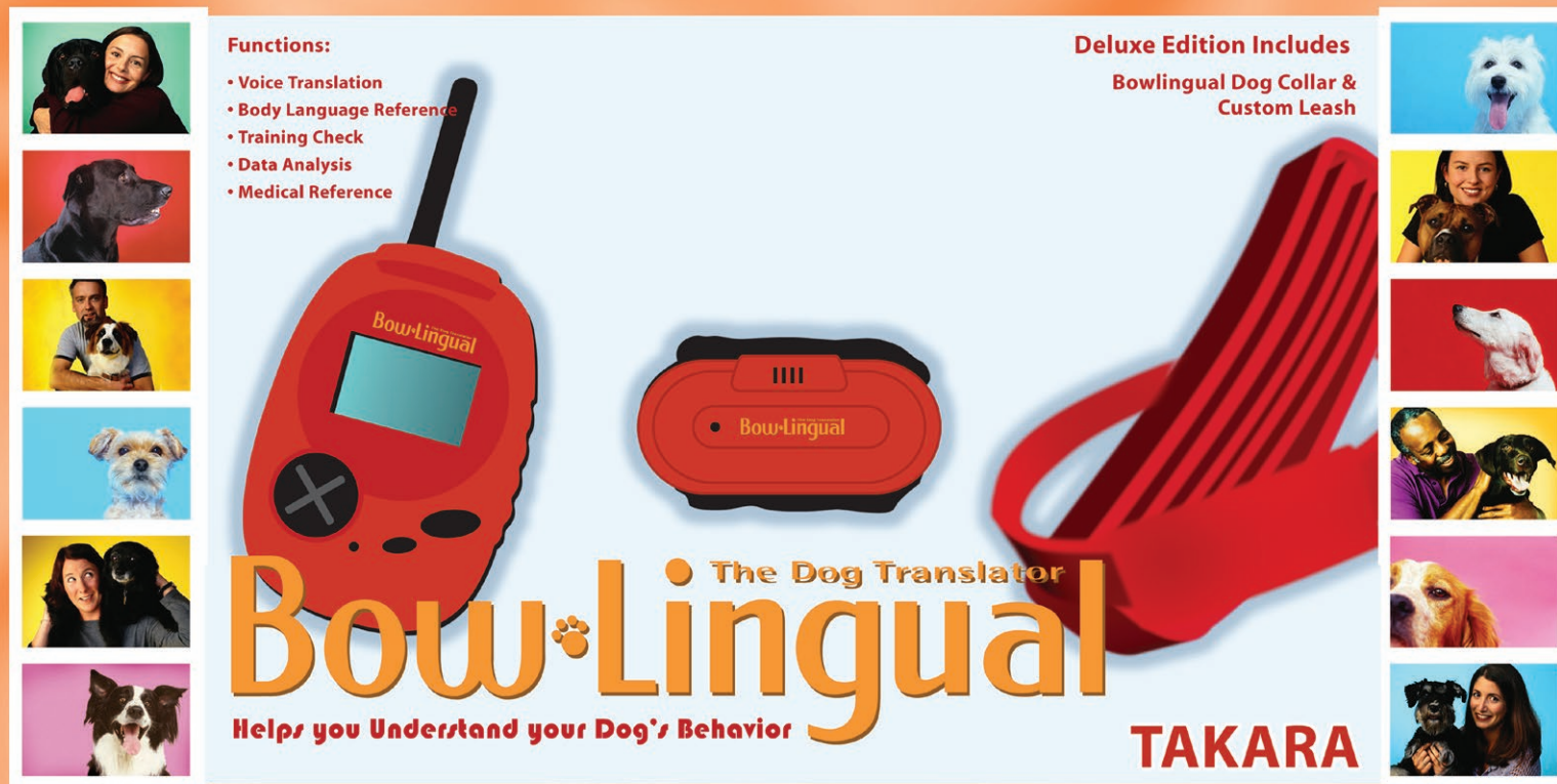
Takara "BowLingual Product Packaing Concepts (2003 )