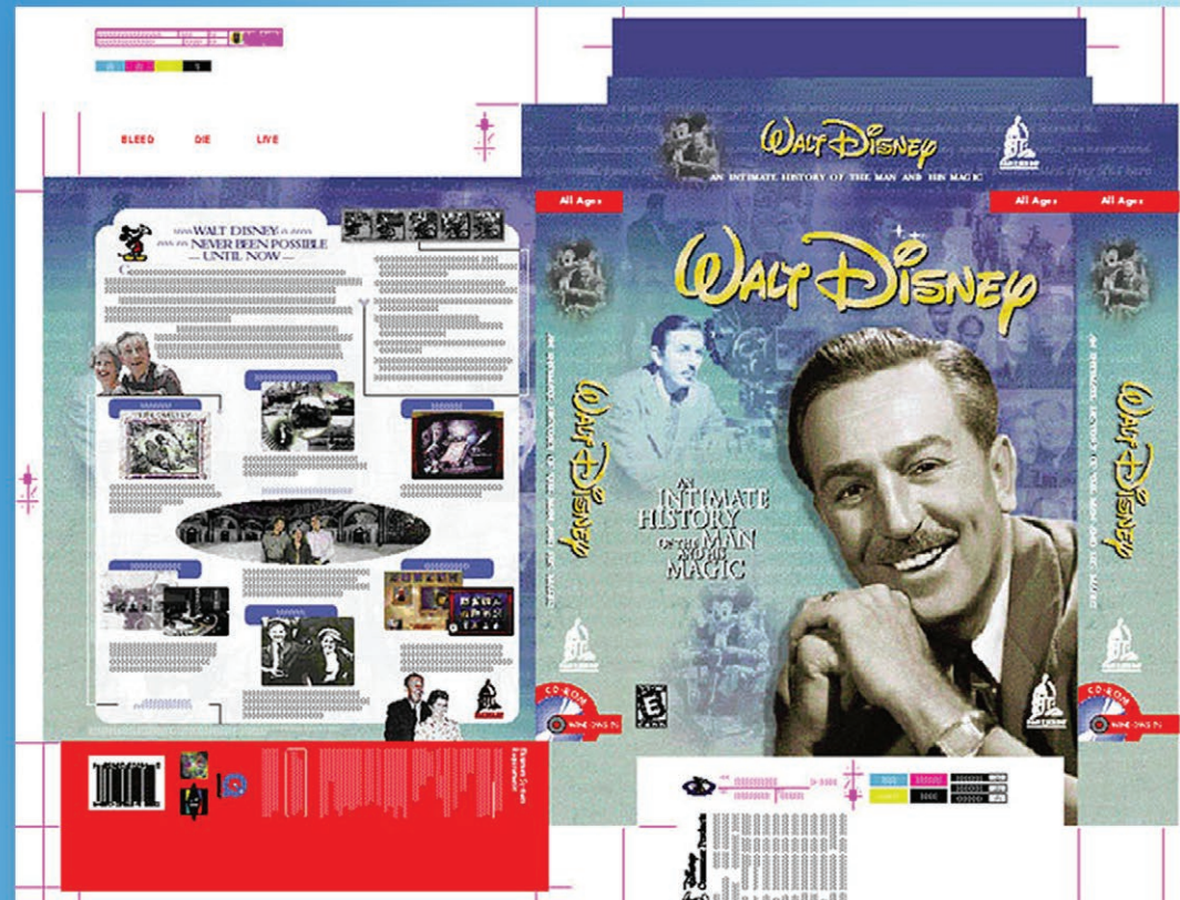
Buena Vista Home Entertainment CD-Rom Software Packaging (1997)